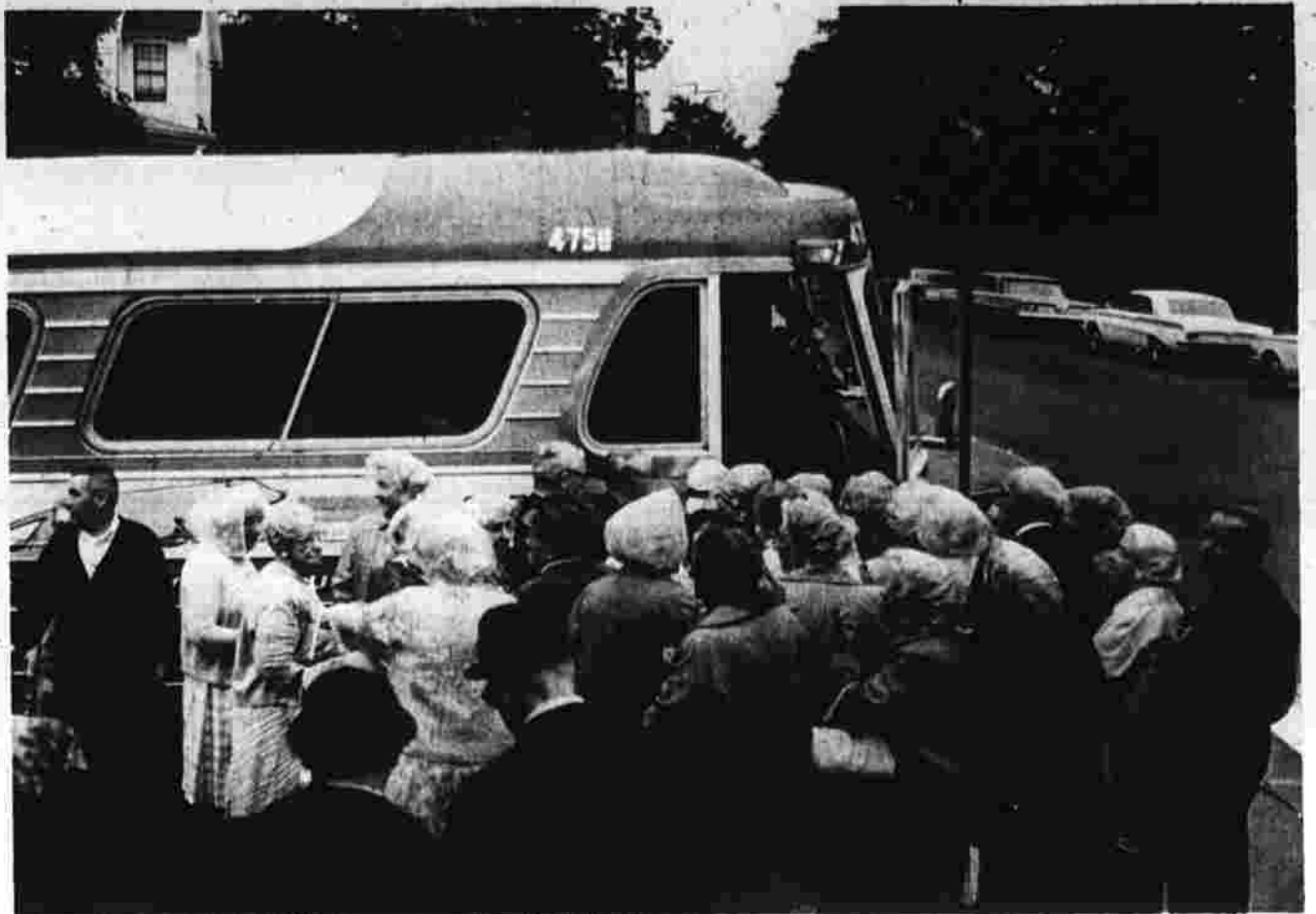
'The Weather Outside Is Stormy...'